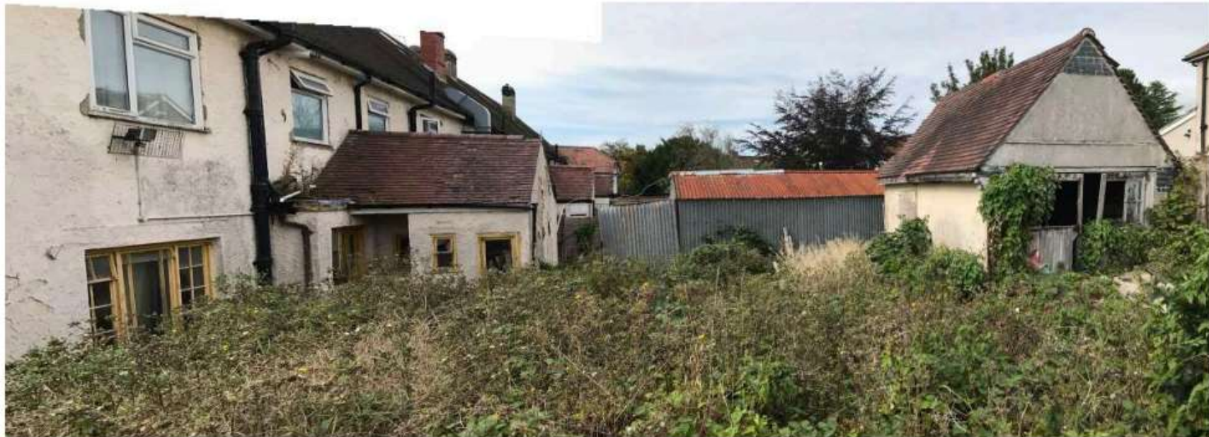
Rear view showing rear additions to retail and garages

Note – updated photos to be added shortly