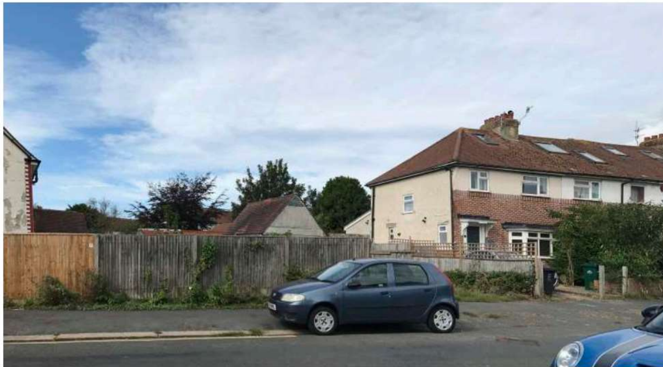
View looking West and No. 94

Note – updated photos to be added shortly